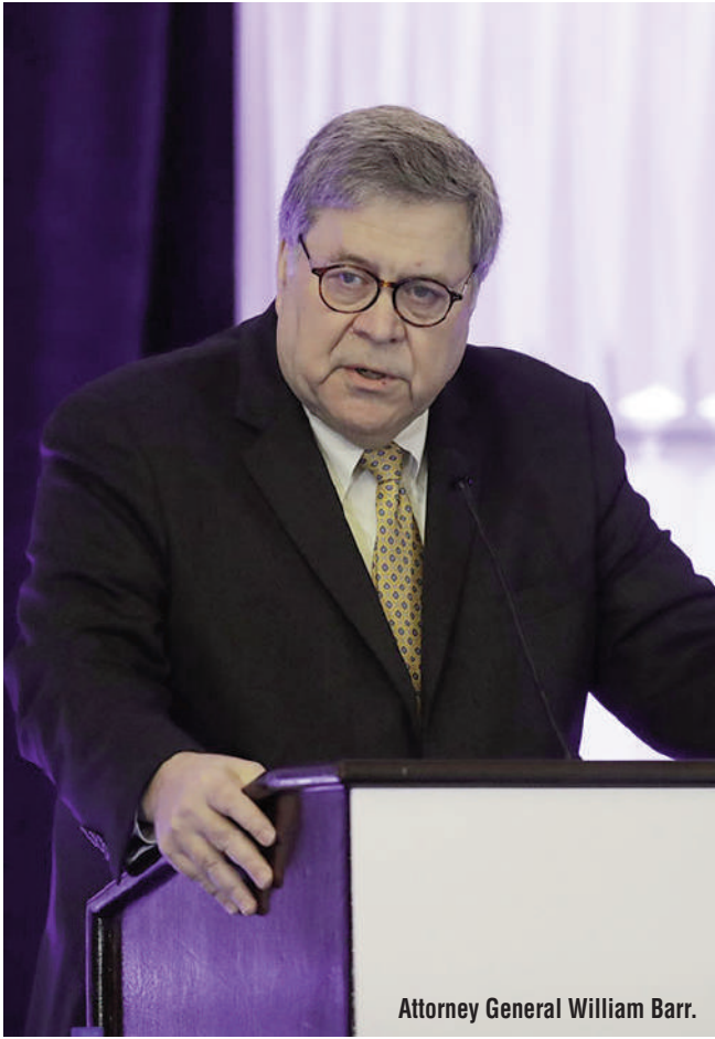
Attorney General William Barr.